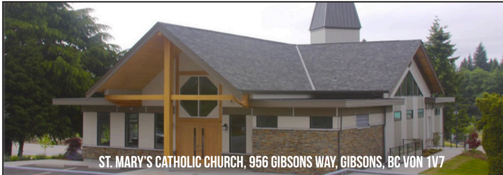
ST. MARY'S CATHOLIC CHURCH, 956 GIBSONS WAY, GIBSONS, BC V0N 1V7